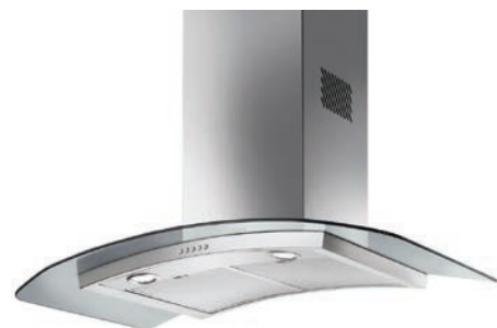
F. Smeg 900mm Wallmount Rangehood SA950CXA

Appliances can be customized by customers, the above appliances are recommended by AMT Grand Homes and included in our price. Client may choose other appliances but will be charged or rewarded the difference (if any).