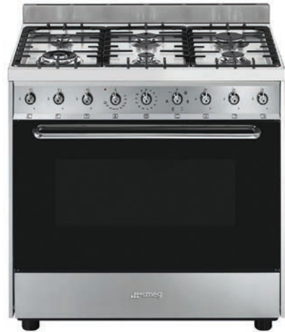
C. STYLE OPTION: Smeg 900mm Gas / Gas Freestanding Cooker