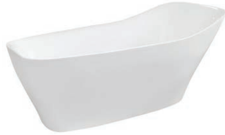
C. Mizu Bliss 1700 Freestanding Bath