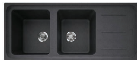
UPGRADE OPTION: Franke Impact Granite Double Sink