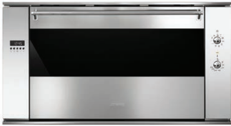
A. Smeg 900mm Classic Multifunction Oven SFA9310XR

Choose from our large range of Designer Appliances.