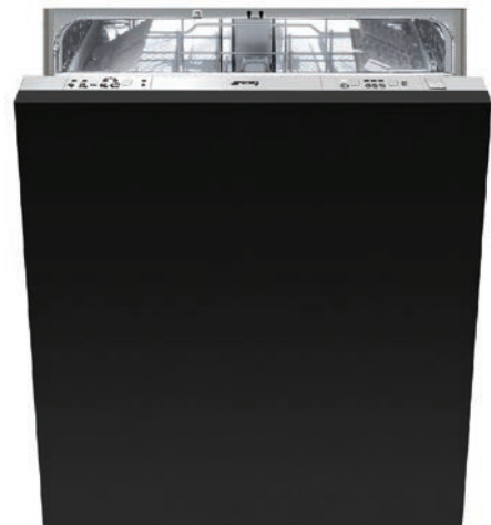
D. Smeg Fully-Integrated Underbench Dishwasher