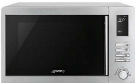
E. Smeg Inverter Microwave with Convection