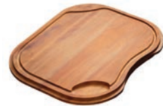
Wooden chopping board