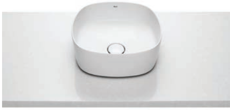
B. Koca Inspria Basin (Choose from Round or Soft Vessel Shape)