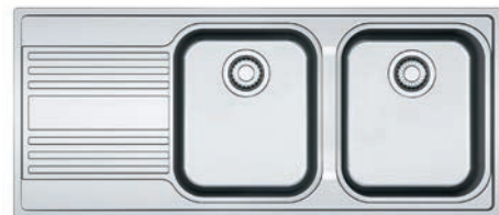
E. Franke Rapid Double Sink