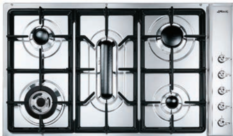
B. Smeg 900mm Classic Gas Cooktop CIR93AXS3