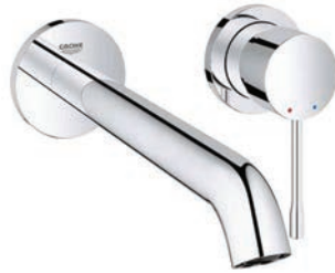
E. Grohe Essence New Wall Basin Mixer Set Chrome