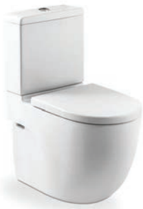
D. Roca Meridian Close Coupled Back Inlet Suite