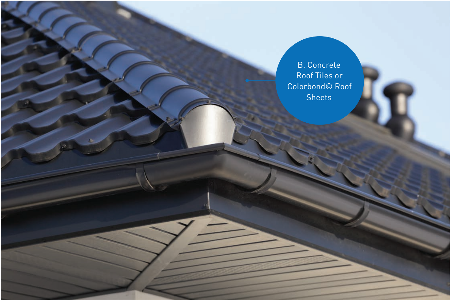
Concrete Roof Tiles or Colorbond® Roof Sheets (Choose from a range of colours)

A. Pivot Designed Entry Door (Choose From a wide range of styles)