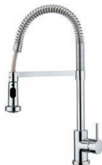
D. UPGRADE OPTION: Franke Professional Pull-out Tap or similar