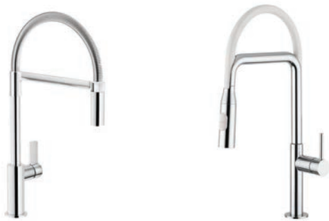
D. Teknobili Pull Down Sink Mixer